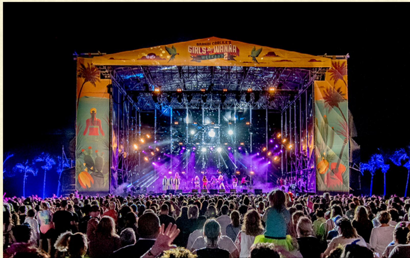
MAIN STAGE WITH FULL SCALE PRODUCTION