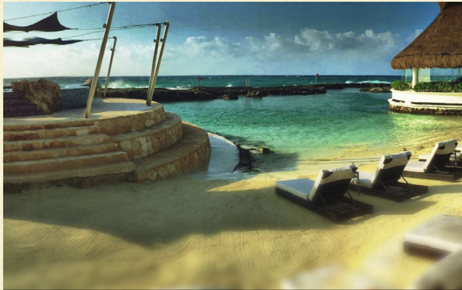
PRIVATE BEACH RESERVED FOR ARTISTS