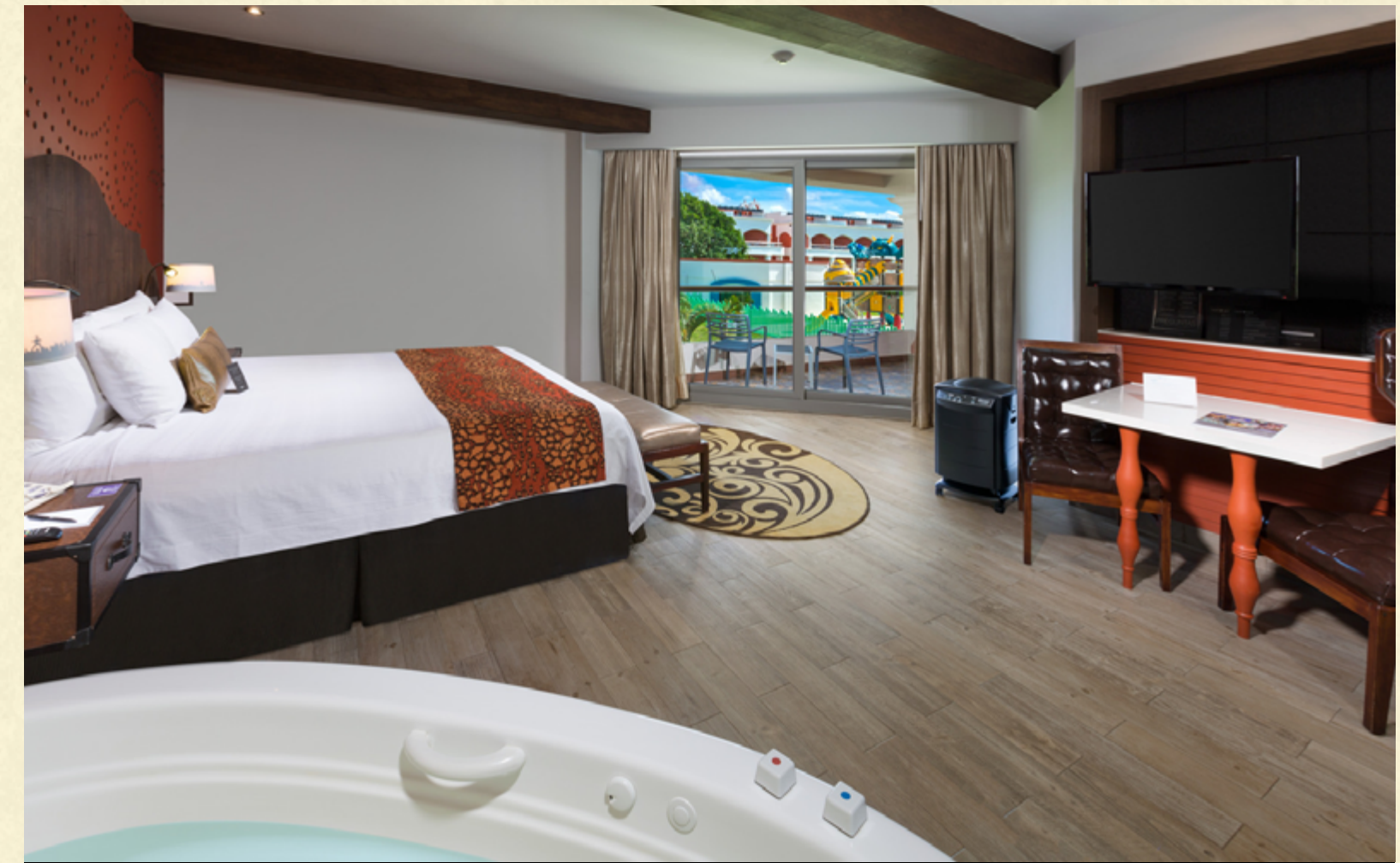
ROOMS JUST A SHORT WALK FROM THE STAGES