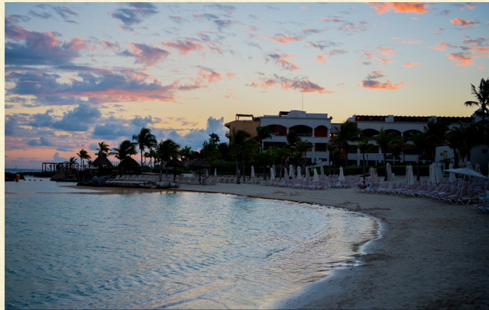
ARTIST LODGING IN A REMOTE SECTION OF THE RESORT