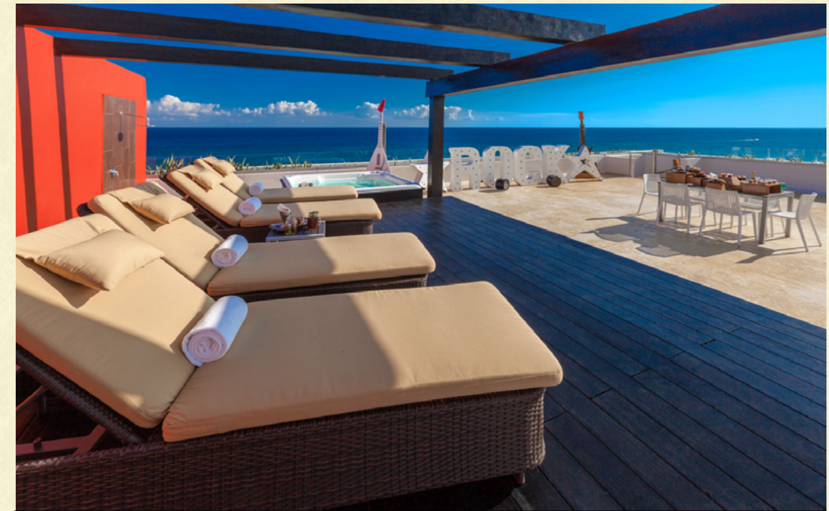
HEADLINER HOSPITALITY SUITE W/ CHEF-DESIGNED MENU & ROOFTOP DECK OVERLOOKING MAIN STAGE