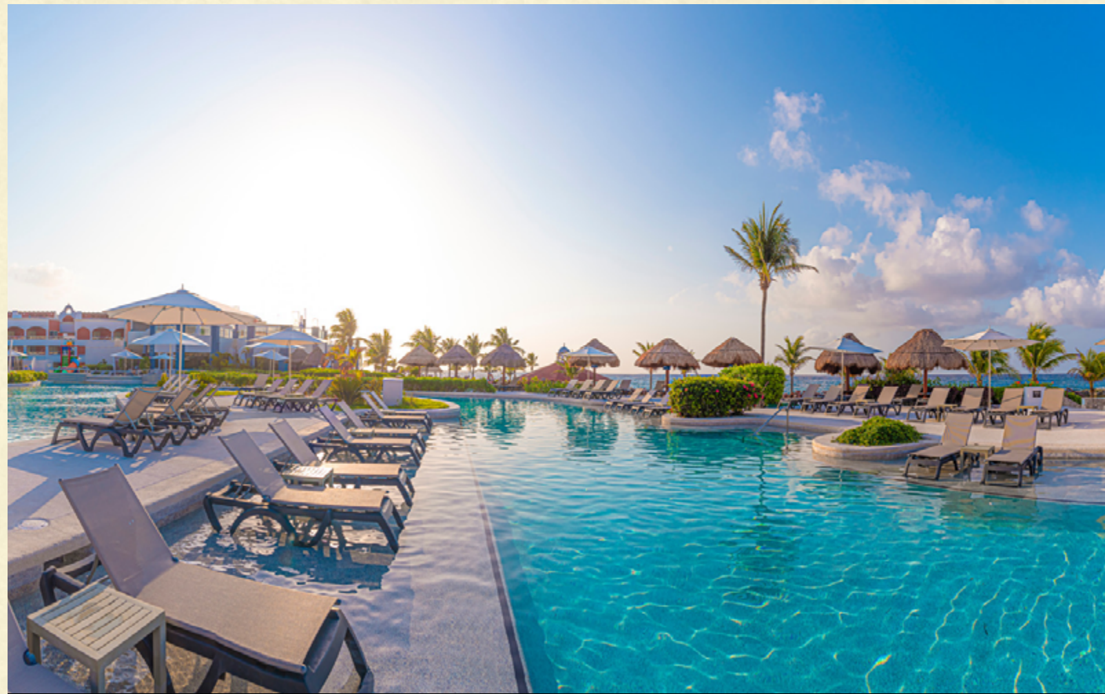
BEACH AND POOL ACCESS FOR PLENTY OF RELAXATION