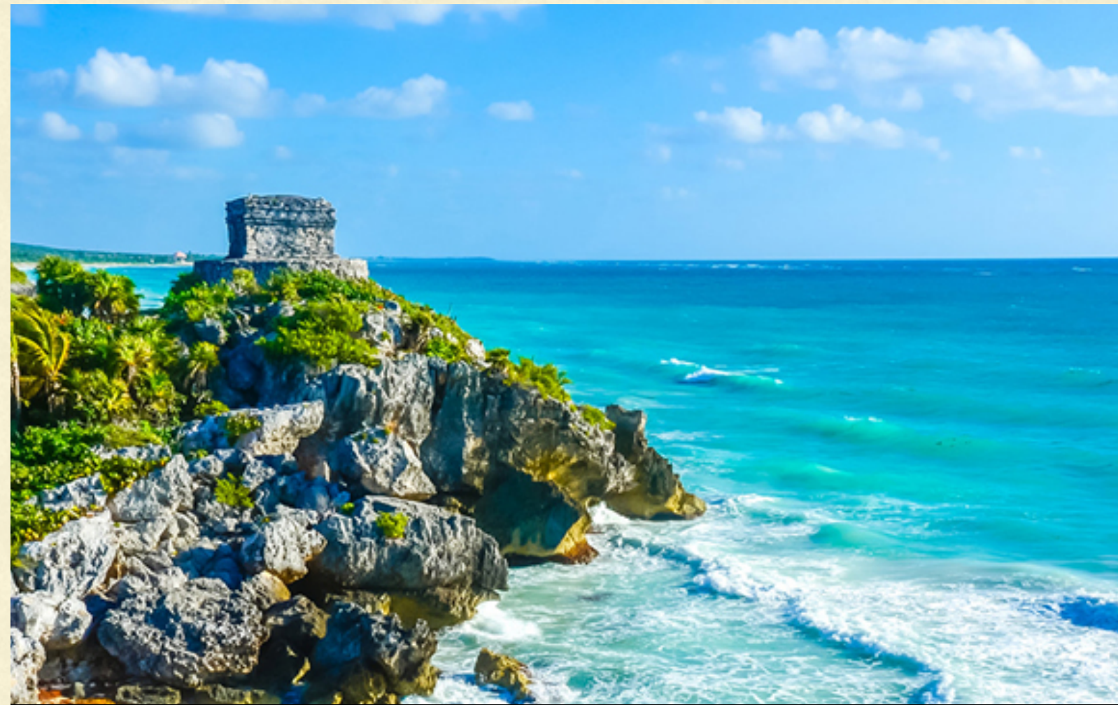
OFF-SITE EXCURSIONS AND CULTURAL EXPERIENCES