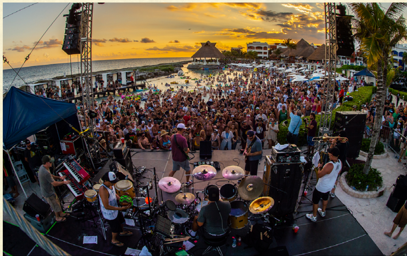
CONCERTS AT MULTIPLE ON SITE STAGES