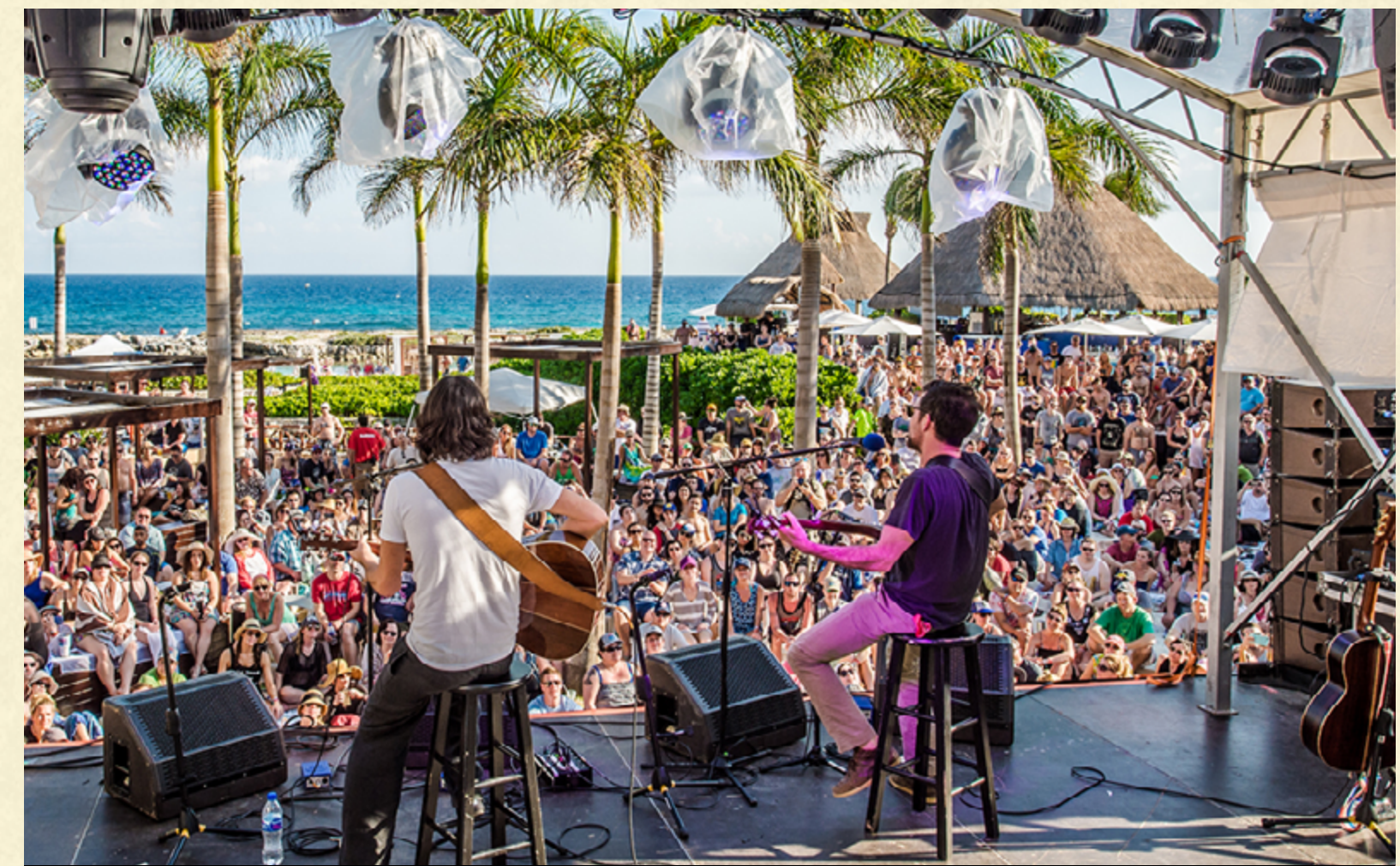
DAILY ACTIVITIES AND WORKSHOPS