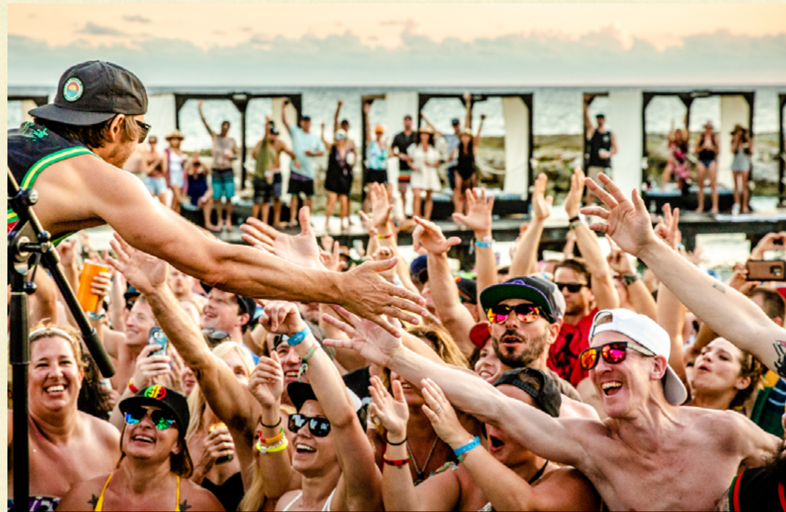
HEADLINER INVOLVED IN CURATING LINEUP & PROGRAMMING