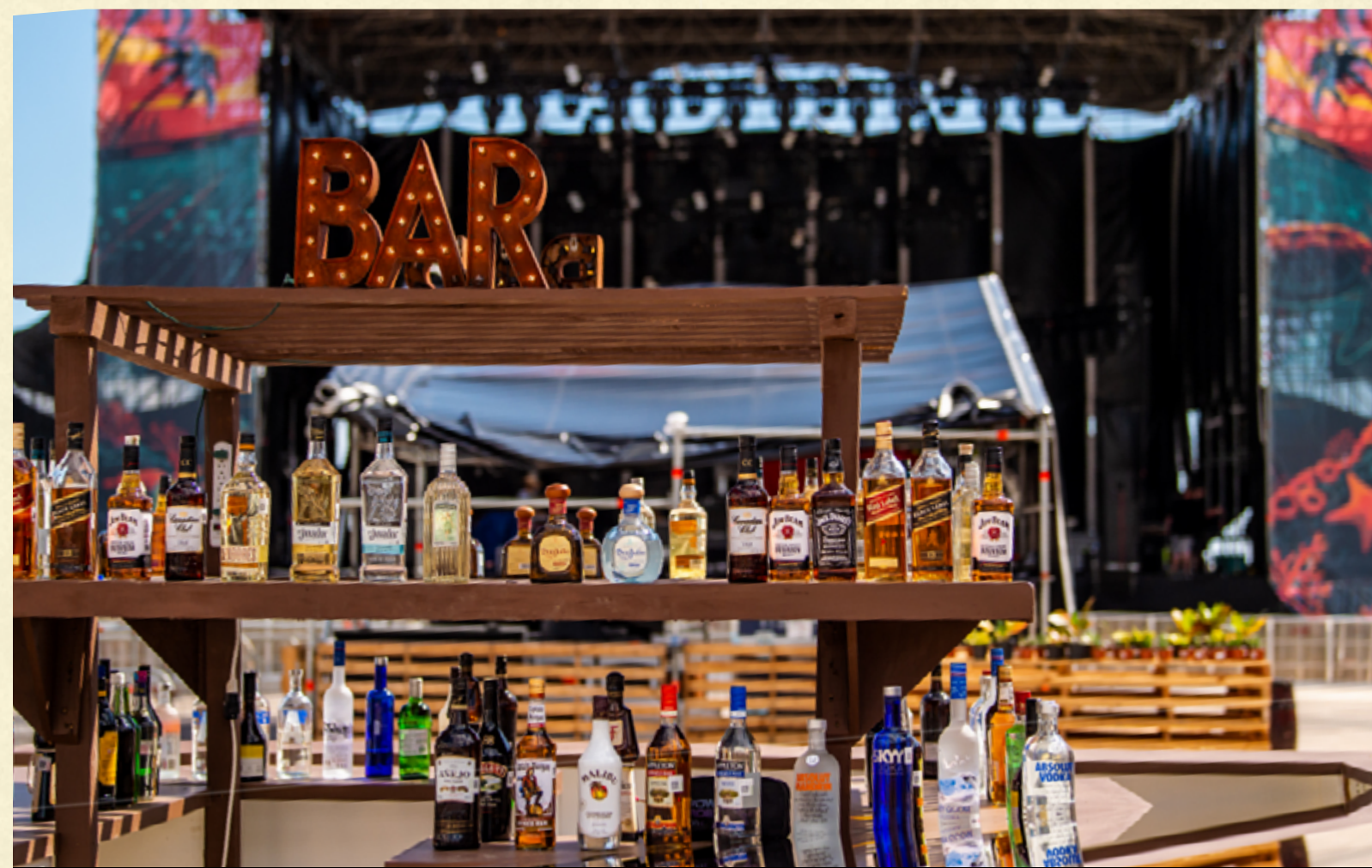
ALL-INCLUSIVE AMENITIES W/ CHEF-CURATED FOOD, CRAFT COCKTAILS & WAIT SERVICE AT SHOWS