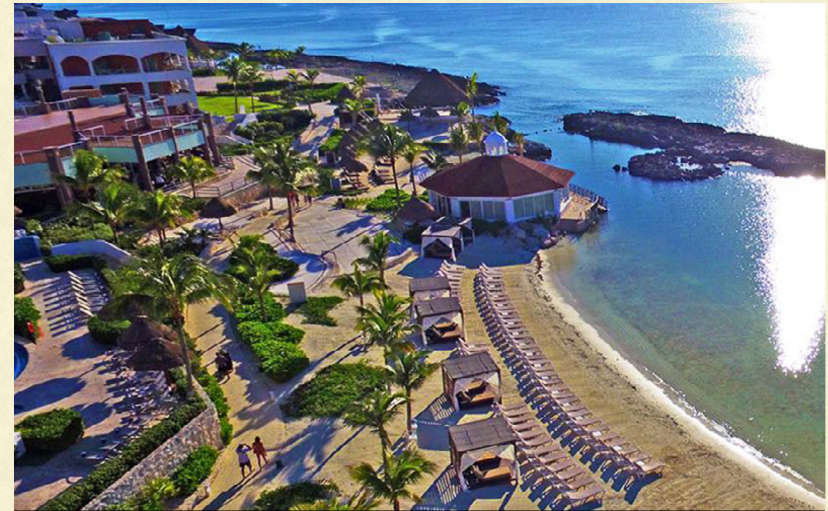
FAMILY FRIENDLY RESORT IDEAL FOR WINTER GETAWAY